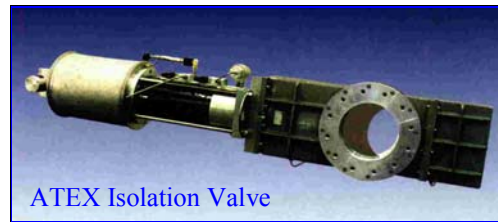
ATEX Isolation Valve